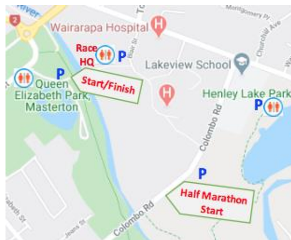
Queen Elizabeth Park